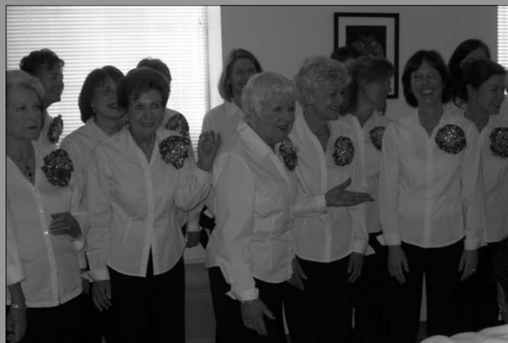
JUNIOR LEAGUE CHORAL GROUP Christmas Concert

This is an anonymous gift. Your name will not be included in our annual report.