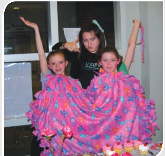
6th grade Bumpus students

(continued from page 1, 11th Annual GALA)